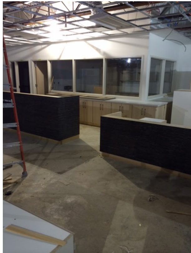
Library Circulation Desk and Library Office Space